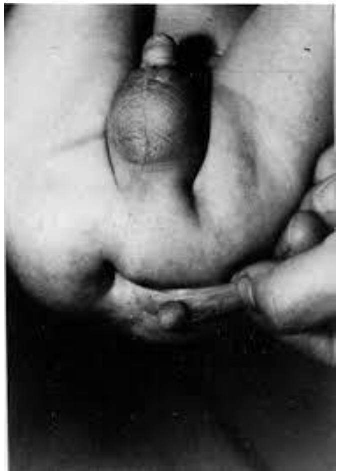
Photograph 1: One case of Diphallia

[Table 2] shows that in males, maximum lesions were hypospadias seen in 13 followed by VUR & PUV in 12 patients and phimosis in 6 and one case of diphallia [Photograph 1]. In females, maximum lesions were congenital hydronephrosis, pelvic kidney, horse shoe kidney, ectopic ureter and ectopia vesicae seen in 1 patient each.