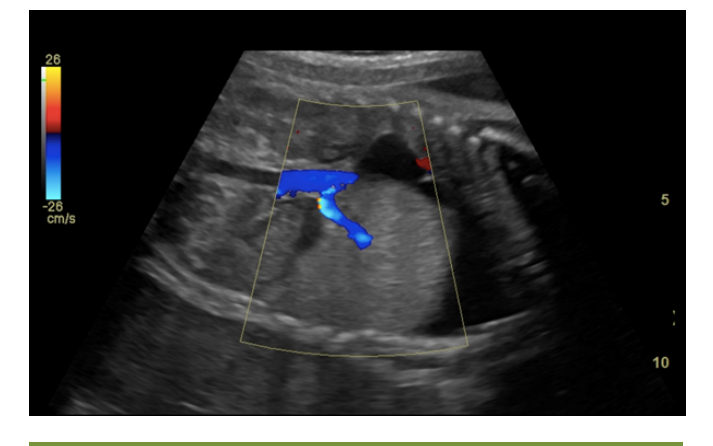
Figure 2: Colour Doppler study revealing feeding artery arising from the descending thoracic aorta.

Pulmonary sequestration, also known as bronchopulmonary sequestration (BPS), is a cystic mass of non-functioning pulmonary tissue that does not communicate with the tracheobronchial tree. In addition, the blood supply is not from pulmonary artery but from a feeding artery which comes from the descending aorta. Two forms of pulmonary sequestration are typically seen: ILS which exists within the normal lung parenchyma, and ELS which has separate pleural layer and is thus completely separated from the normal lung parenchyma. In a few cases, this cystic mass may exist outside the thoracic cage as well. BPS is a common congenital abnormality of the lung tissue, which is only second to congenital cystic adenomatoid malformation (CCAM). It has been observed that the