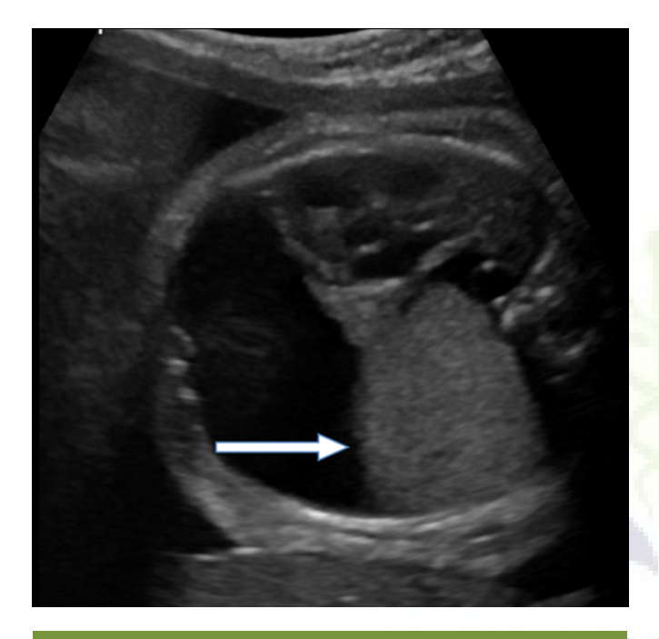
Figure 1: Ultrasound showing a solid well-defined echogenic mass with underlying collapse and associated pleural effusion with resultant shift of mediastinum and heart towards right side.

ray found small lung volumes. High Resolution Computed Tomography was done immediately. There was evidence of a large well defined soft tissue mass involving the left pleural cavity with pleural effusion, and shift of mediastinum and heart towards the right side. In addition, there was an evidence of a feeder artery originating from the descending thoracic aorta [Figure 3]. Mass resection was considered but not performed due to hypoplastic lungs. The neonate expired at 18 hours of age.