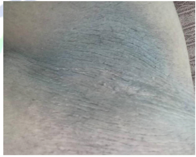
Figure 2: Acanthosis nigricans involving axilla.

A 25-year-old male presented with acute diabetic ketoacidosis with blood glucose level of 560 mg/dl , was managed according to standard protocols. Due to presentation with diabetic ketoacidosis, type 1 diabetes was suspected and patient was positive for anti-insulinoma associated antibodies (4.1 U/ml), anti-Glutamic acid decarboxylase (10 U/ml) antibodies, c-peptide levels (0.6 ng/ml) were low. Patient's BMI was 32 kg/m2 and diffuse acanthosis nigricans was present around neck (figure 1) and axillary region indicating insulin resistance (figure2) along with this patient had a strong family history of type 2