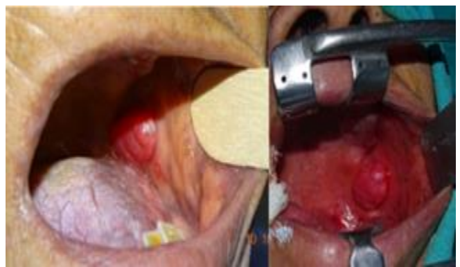
Figure 1: Preoperative (right) and intraoperative (Left) oral cavity examination

There was no clinically palpable cervical lymphadenopathy. On slide review in our institute, poorly differentiated malignancy was reported, and immunohistochemistry was advised, which demonstrated positivity to cytokeratin (CK), Synaptophysin and weakly positive for chromogranin and negative for S -100, suggesting it to be a small cell carcinoma. The Contrast-enhanced computed tomography (CECT) from the base of the skull to the diaphragm showed an enhancing lesion involving left buccal mucosa without any bony involvement and cervical metastasis [Figure 2] however, distant metastasis in the lung was noted.