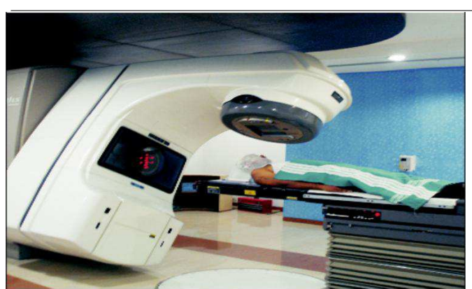
Picture 1: Patient on Treatment in Linear Accelerator with Immobilization Mask