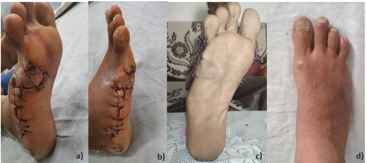
Figure 2: Fillet flap.