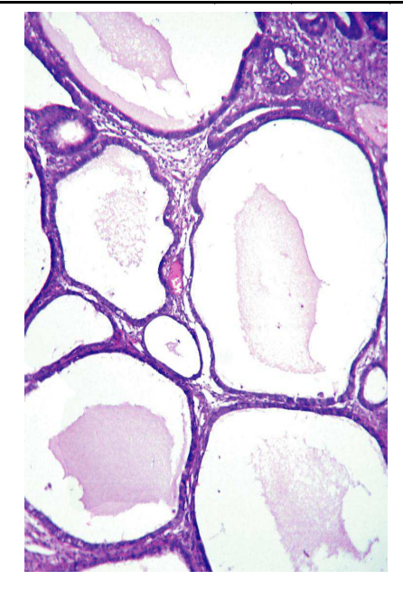
Figure 1: Simple hyperplasia without atypia (H&E X 100)