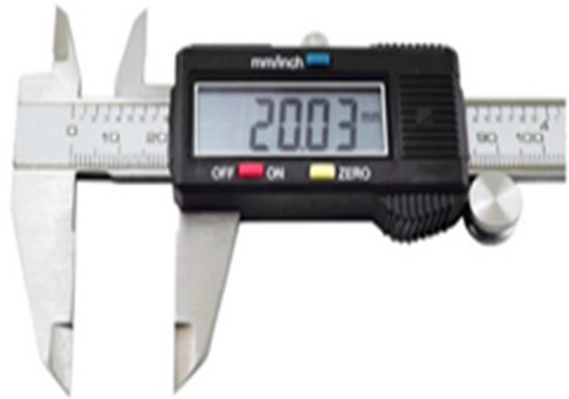
Figure 2: Digital Vernier Caliper

length, total lobule width were measured. Total ear length [was measured as the distance from the most superior point of the helix (A) to most inferior point of the ear lobule (B)]. Total ear width was determined by measuring along the broadest part of the pinna from the (D) to (C) as shown in [Figure 3].