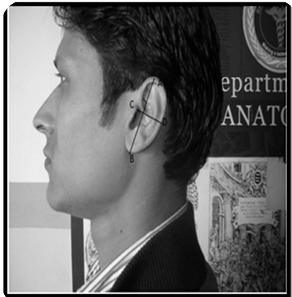
Figure 3: Left pinna showing the total length A to B and ear width from C to D.

Total lobule length was taken as the distance from the tip of anti-tragus (E) to most inferior point of the lobule (B) and the total lobule width was measured as horizontal distance of the lobule at the midpoint of the lobule length (EB) in [Figure 4].