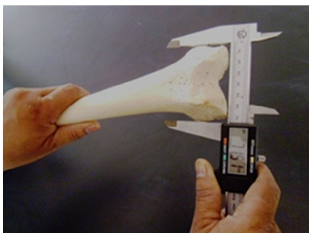
Figure 2: A photograph showing measurement of epicondylar breadth of femur using digital sliding vernier caliper