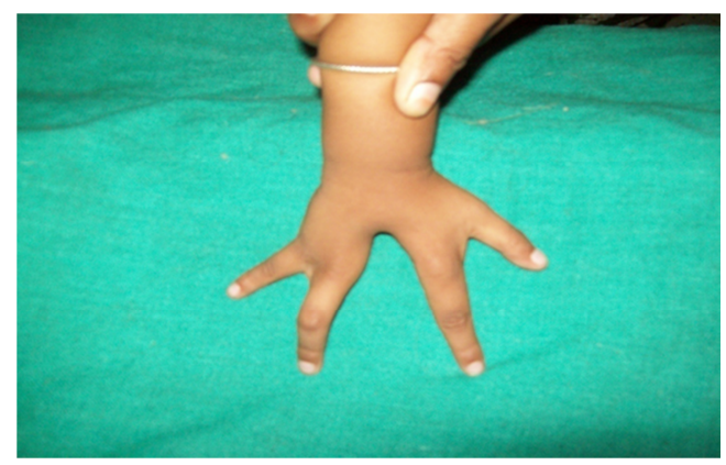
Figure 4: showing central cleft hand (dorsal aspect)