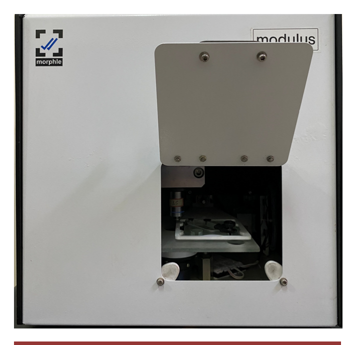
Figure 1: Morphle whole slide scanner

ashboard/] provided by the manufacturer [Figure 2]. The actual screen with various tools (including case info, slide info, zoom button, preview, annotation tools, grid view, settings, screen shot and screen share) and magnification adjustment is shown in [Figure 3]. The uploaded slides were used for demonstration by the primary author using an iPad connected to a highdefinition projector through an apple TV. The purpose of using the iPad was the portability of the device that would allow the author to magnify the image using the touch screen feature while moving around the demonstration room. Even a normal laptop or a desktop connected to a high-definition projector is good enough to run the demonstration just with click of a mouse. The slides were magnified from the lowest possible magnification of 0.7x to 80x [Figure 4] with a simple touch and enabling all 50 students to get the feel of observing the slide under the CLM with shifting of the objective.