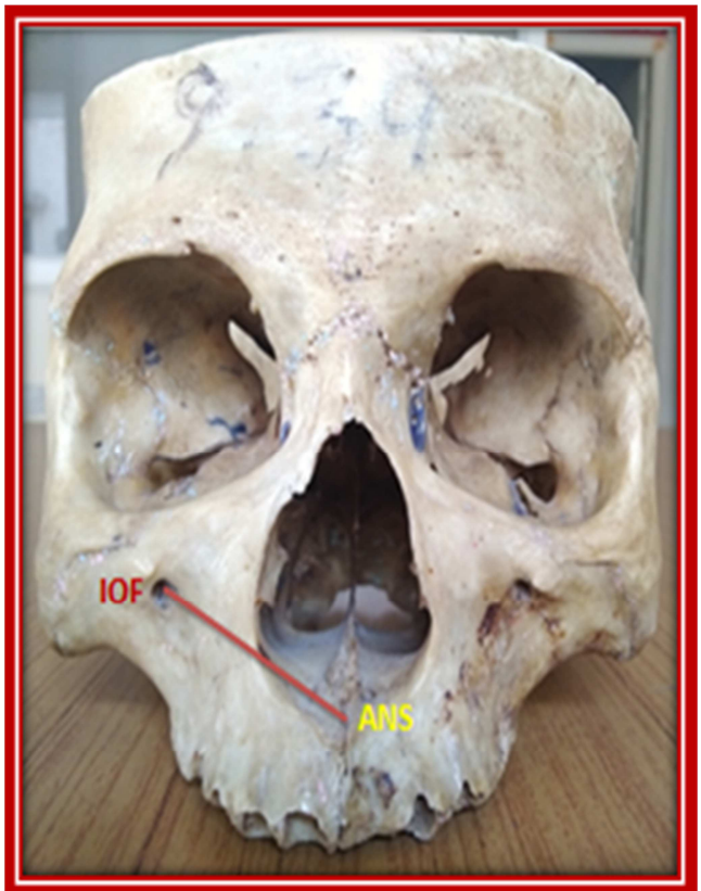
Figure 4: Distance between the anterior nasal spine (ANS) and the centre point of infraorbital foramen (IOF).