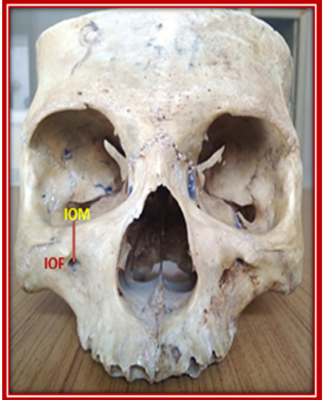
Figure 3: Distance between inferior orbital margin (IOM) and the centre point of infraorbital foramen (IOF)