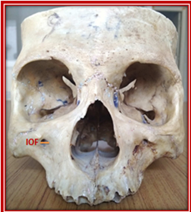
Figure 2: Measurement of the Horizontal diameter of the infraorbital foramen (IOF)