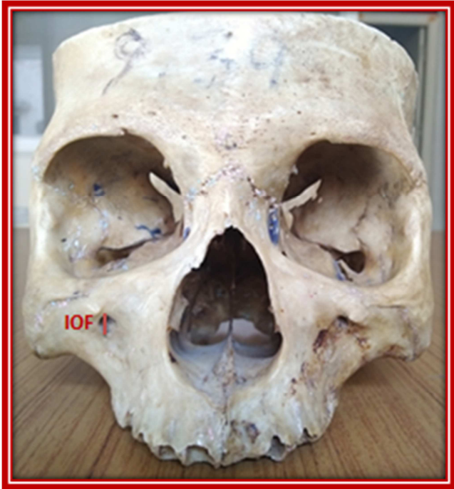
Figure 1: Measurement of the vertical diameter of the infraorbital foramen (IOF).

infraorbital foramen was determined by measuring the distance from the centre of the infraorbital foramen to infraorbital margin [Figure 3], distance from the centre of the infraorbital foramen to anterior nasal spine [Figure 4], distance from the centre of the infraorbital foramen to piriform aperture [Figure 5]. The measurements were taken by the digital vernier calipers.