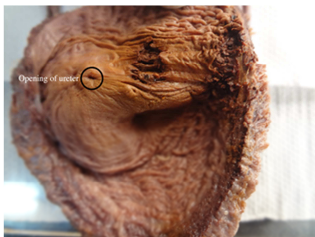
Figure 3: Opening of ureter at the superolateral angle of trigone.