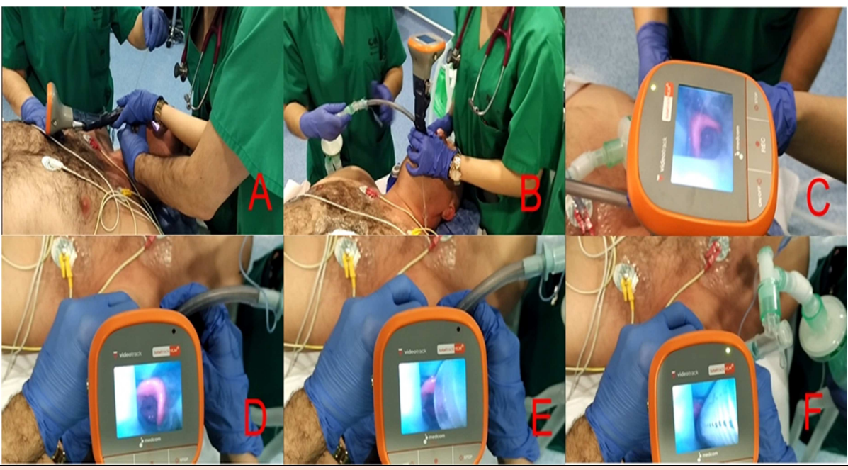
Figure 2: Intubation, A to F.

We used Totaltrack® VLM as SAD in Bailey's maneuver to allow us a viable and safe extubation strategy but with continuous visualisation and uninterrupted ventilation, changing from Deep anesthesia to Superficial anesthesia at the end of the surgery, controlling gradual awakening, seeing the vocal cords, achieving to remove our device once the patient is ventilating correctly. [4]