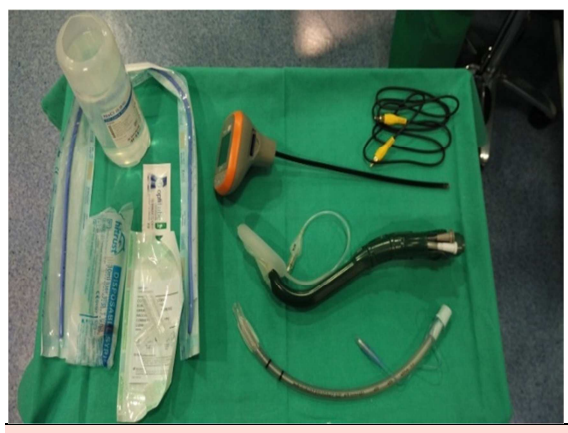
Figure 1: TotalTrack® VLM.

Pre-existing airway concerns, such as difficult mask ventilation, intubation, obesity and obstructive sleep apnoea (OSA) make mandatory a wary extubation. After non-systematic reviews about extubation management (using databases, Google Scholar and expert opinions) the incidence of extubation failure varies between 6% and 47%. Extubation failure and subsequent re-intubations are associated with an overall increase of the mechanical ventilation duration, increased mortality, need for tracheostomy and higher medical costs.