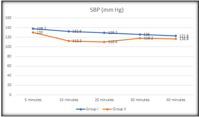
Graph 1 Assessment of systolic blood pressure

The mean onset of sensory block was 4.6 minutes in group I and 1.3 minutes in group II. The mean duration of motor block was 5.3 minutes in group I and 1.2 minutes in group II. The mean duration of sensory block was 2.2 minutes in group I and 3.4 minutes in group II. The mean duration of motor block was 2.7 minutes in group 1 and 3.9 minutes in group II [Table 2].