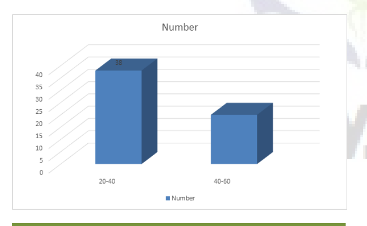
Figure 1: Age wise distribution

Out of 58 patients, age group 20-40 years comprised of 38 (65.5%) and 40-60 years had 20 (34.5%) patients. The difference was significant (P < 0.05) [Table 1, Figure 1].