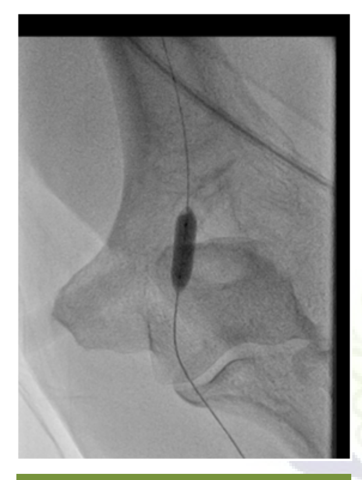
Figure 5: Fistuloplasty of the stenotic segment performed with 3.5 x 10 mm coronary balloon

was diagnosed when there were reduction of the vessel diameter of more than 50% and an increase in PSV ratio (PSV in the stenotic area/ PSV upstream the stenotic area) greater than 2: 1 in the draining vein or greater than 3: 1 in the anastomotic area.<sup>[8]</sup>