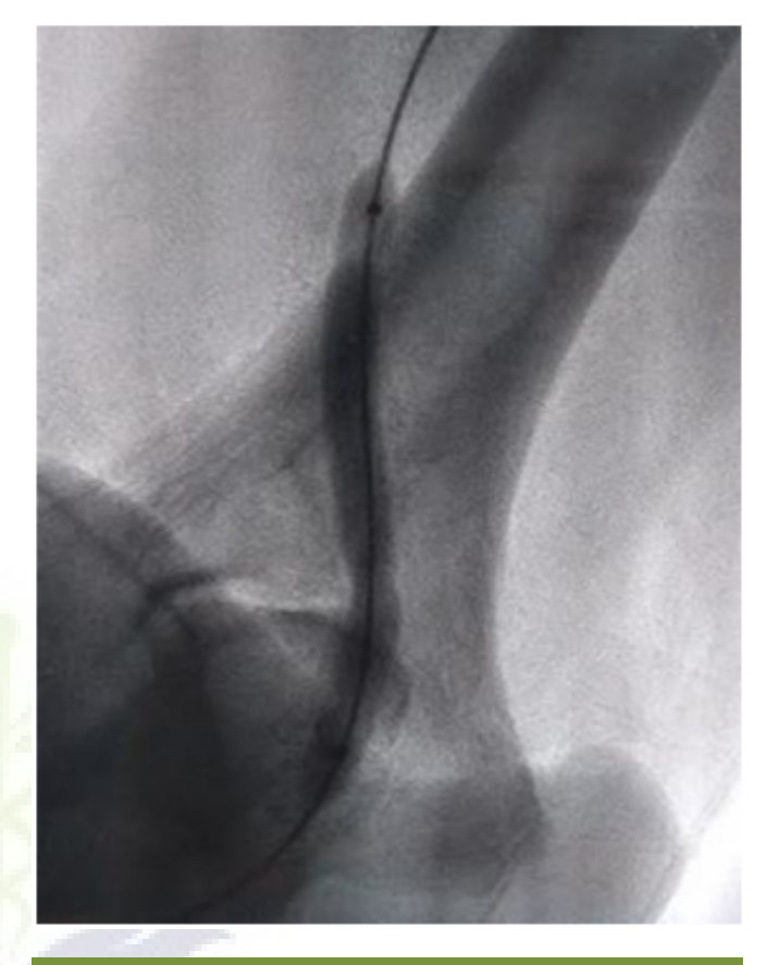
Figure 2: Fistuloplasty of the stenotic segment with 6mm x 40mmnon-compliant balloon at 10atm pressure

and mortality rates when compared with synthetic AVGs and catheter dialysis access.