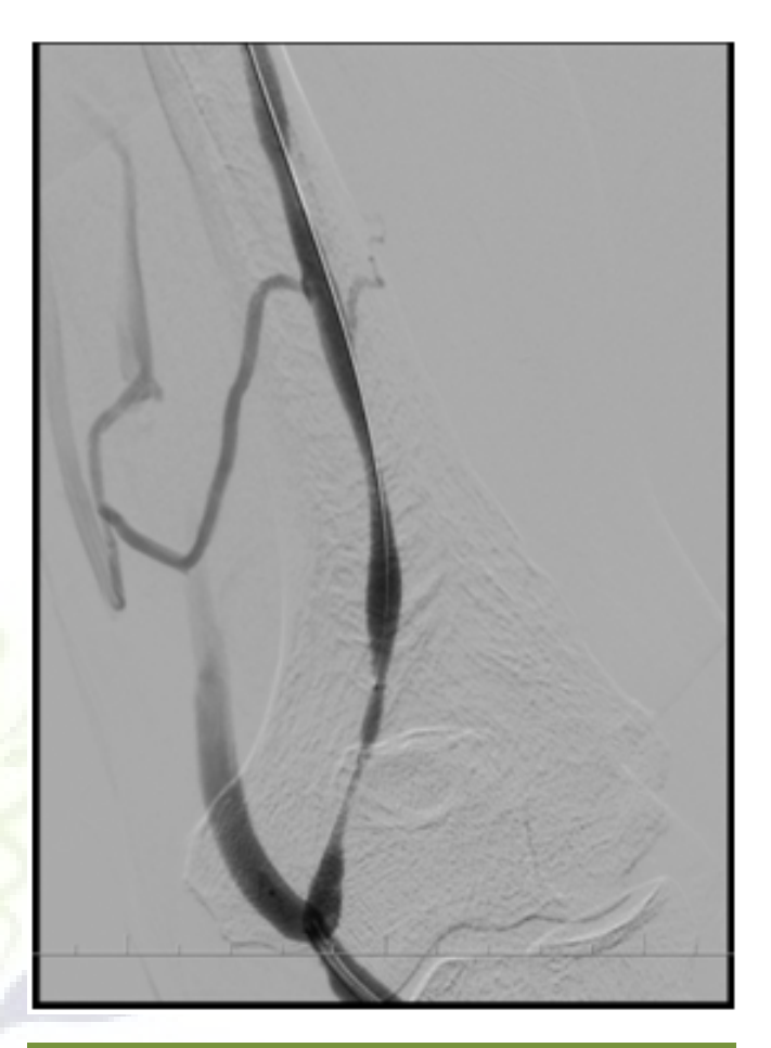
Figure 4: Retrograde venogram through cephalic vein demonstrating marked stenosis of the juxta anastomotic draining vein

During Doppler examinations, the patient positioning was most often supine, with the arm relaxed and extended out to the side, with the area to be evaluated closest to the sonographer. The patient may be positioned in a Trendelenburg position with hands over the head or examined in the sitting position. Patient position should be optimized so that gravity helps dilate the veins. Doppler examinations were performed using linear arraystransducers (5–10 MHz). Examination included the afferent artery, site of anastomosis, the draining veins as far as the subclavian vein as well as the arterial tree distal to the AVF in cases experiencing steal syndrome.All vessels were examined in both transverse and longitudinal planes using gray-scale and color images. At first, the vessels were