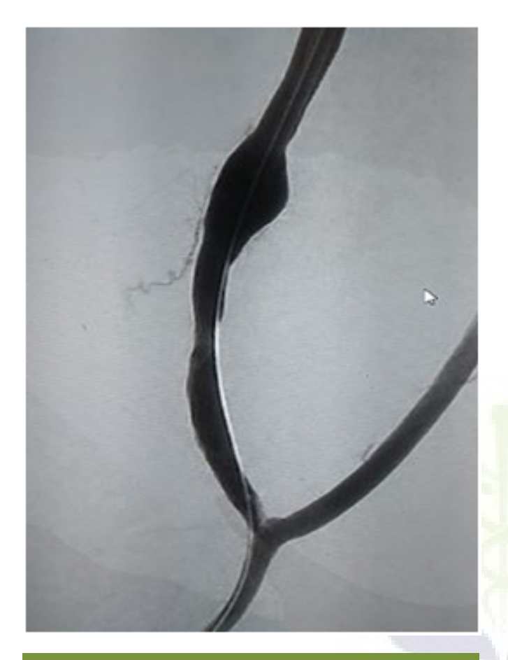
Figure 3: Post fistuloplasty angiogram demonstrating complete dilatation of the stenotic segment upto the fistula site

A hemodynamically significant stenosis leading to dialysis fistula dysfunction is associated with an increased rate of fistula thrombosis along with significant morbidity.