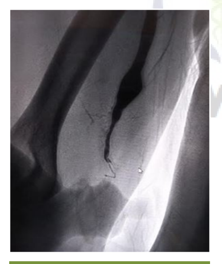
Figure 1: Retrograde venogram through cephalic vein demonstrates marked stenosis of the juxta anastomotic draining vein