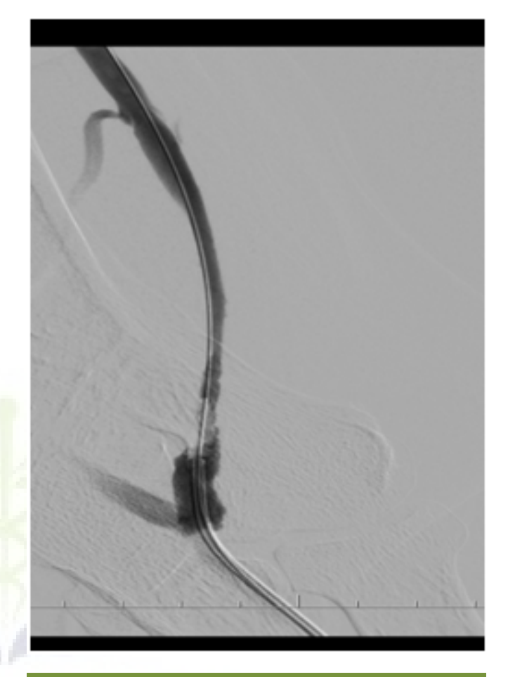
Figure 6: Post fistuloplasty angiogram demonstrating dilatation of the stenotic segment optimal for normal flow rate during fistula. Residual clots were seen (asterisk) which were resolved on heparin

The etiologic mechanism of juxtaanastomotic stenosis is unclear, but multiple hypotheses exist. These hypotheses include the loss of the vasa venosum during skeletonization for mobilization of the most peripheral part of the vein,