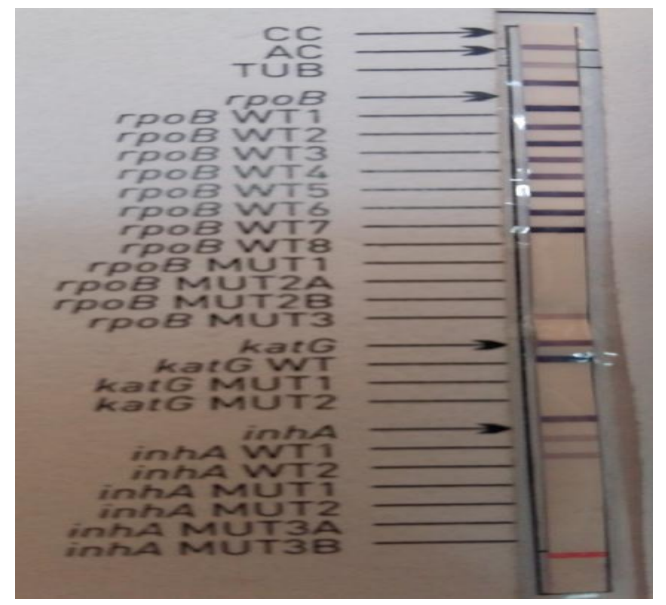
Figure 1: RIF mono resistant

In our study majority of patients were in age group of 41-60 years followed by above 60 years age group. [Table 3]