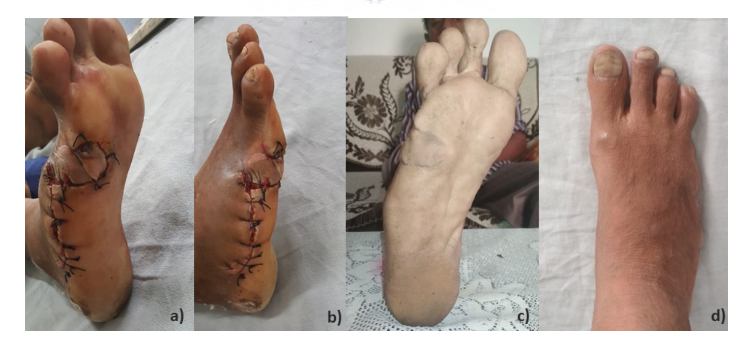
Figure 2: Fillet flap.