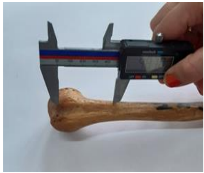
Figure 1: Showing the measurement of MWL

Data was recorded separately for right and left humeri then it was analyzed statistically using independent t test. P-value <0.05 were considered significant. The data was presented as mean \pm SD.