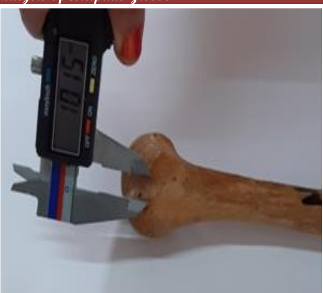
Figure 3.Showing measurement of width of BG