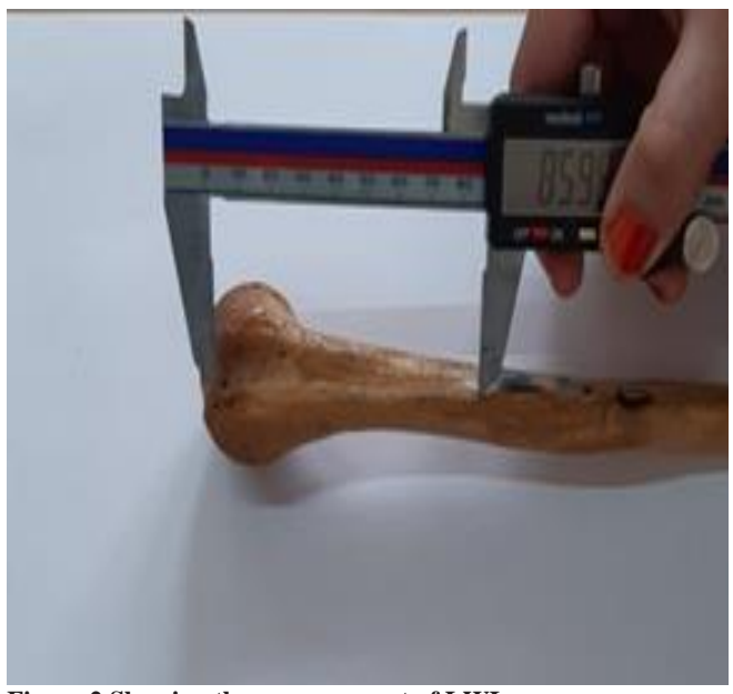
Figure 2.Showing the measurement of LWL