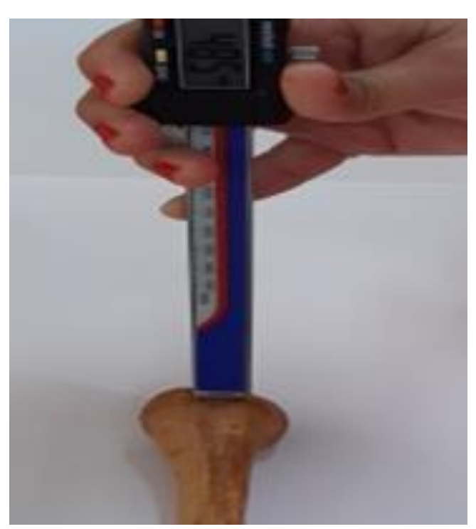
Figure 4.Showing the measurement of depth BG

MWL = medial wall length LWL = lateral wall length BG = bicipital groove