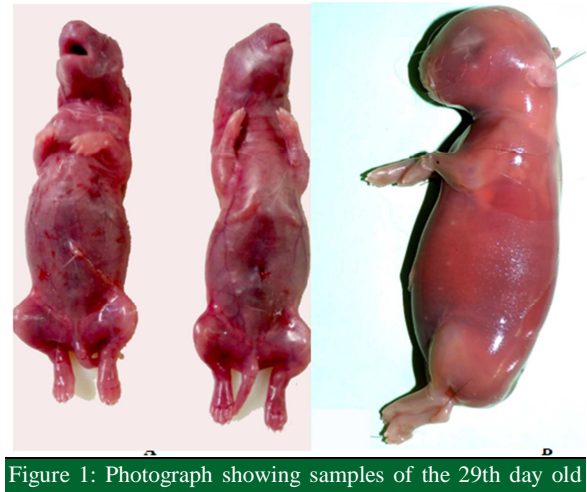
Figure 1: Photograph showing samples of the 29th day old fetuses of the control group (A) and treatment group (B)

The axial and appendicular skeletons of the rabbit fetuses of the treatment and control groups were stained red, while the muscles did not take the stain. So that it was easily to identify the details of the parts of the normal skeletons and these with anatomical disorders. The fetuses were clear and the skeletons were seen through them. In the fetuses of the control group, the axial skeleton including skull with mandible, vertebral column, sternum, ribs and caudal