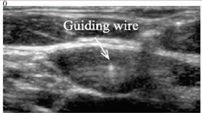
Figure 3: Short Axis of IJV with linear probe