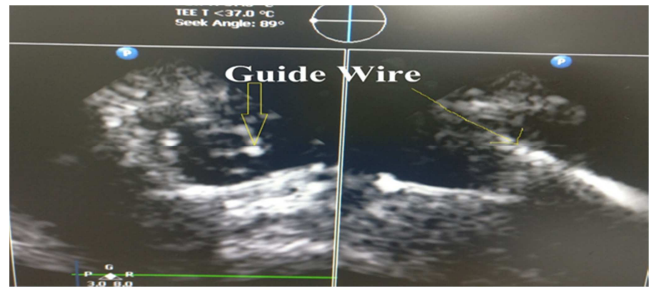
Figure 2: Bi-plane Mode Visualization of Guide-wire in IJV: In plane and Out plane